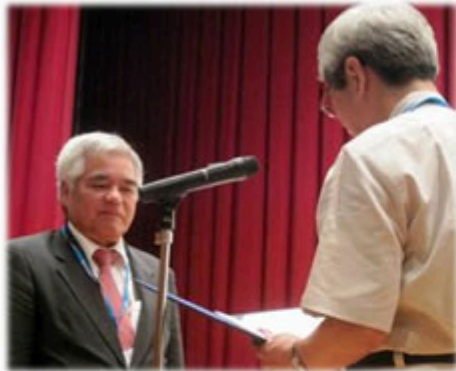
The First JSIT Awards