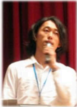
JSIT Research Award: